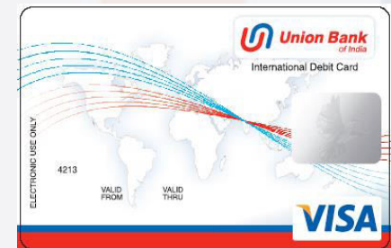
Debit Cards and Prepaid Cards