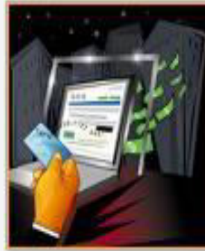
Payment Gateway Solutions