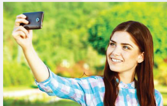
Selfie Account Opening